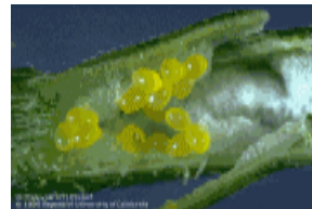
Cluster of alfalfa weevil eggs laid inside an alfalfa stem

No differences were found among the treatments for EAW larval populations 2-DPT ( P>0.05 ), Table 1. All of the insecticide treatments controlled Egyptian alfalfa weevil with larval means that were significantly lower ( P<0.05 ) than the untreated control treatment means from 3-DAT through 14-DAT.