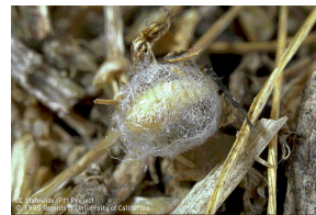
The alfalfa weevil pupates in a coarsely woven white cocoon