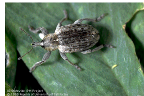
Adult Alfalfa Weevil