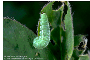
Alfalfa weevil larva