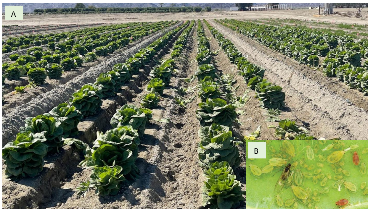
Figure 1. A) Field trial plots of ‘Coastal Star’ romaine lettuce and B) winged or wingless adults and nymphal stages of green peach aphid.