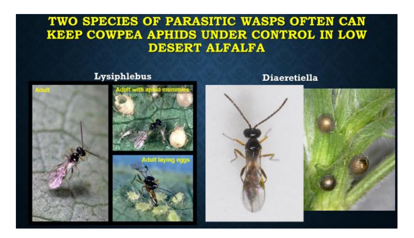
Fig. 1. Lysiphlebus testaceipes and Diaeretiella rapae , two wasp species providing biological control of cowpea aphid

Two species of parasitic wasps in the family Braconidae commonly attack cowpea aphids in California – Lysiphlebus testaceipes and Diaeretiella rapae (Fig.1) . Both of these small wasps attack a wide range of aphids, such as cotton/melon aphid and many other aphid species on other crops. The wide range of aphid hosts allows these wasps to have available aphid hosts all year long in the low desert.