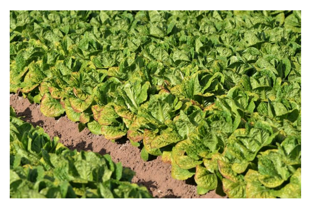
Figure. 2. Romaine lettuce field where plants are affected by lack of nutrient or chemical application, but not infected by INSV. (Photo taken on 22 February, 2022, Imperial County).