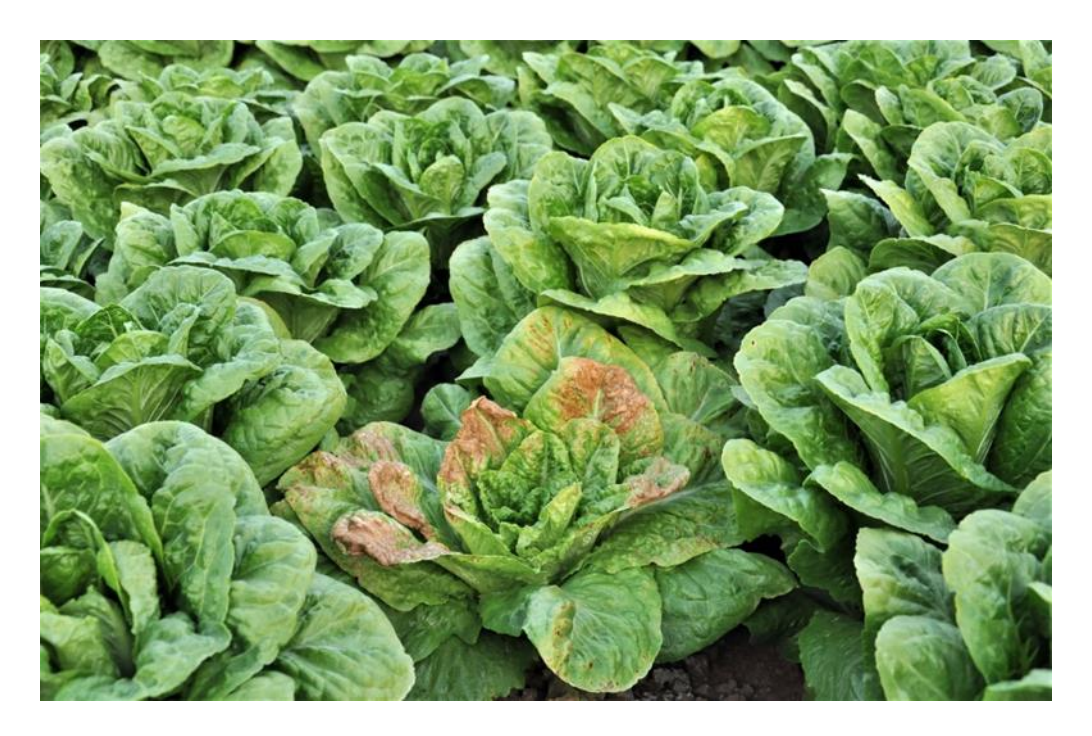
Figure.1 INSV infected Romaine lettuce- usually seen in individual random plant in the bed without any pattern. (Photo taken on 21 March, 2021, Imperial County).

If you come across any symptomatic lettuce plants and would like to get checked, please let me know. I will be happy to come visit the field and test some plants for the virus.