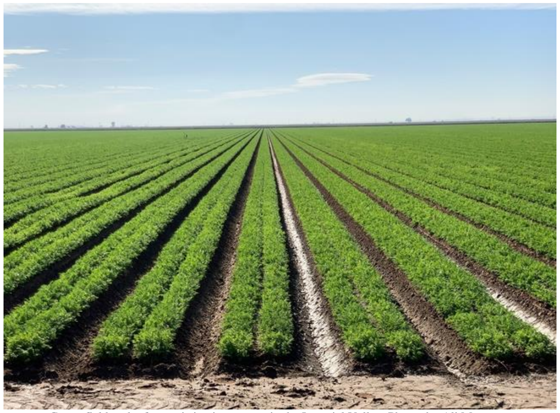
Carrot field under furrow irrigation system in the Imperial Valley.

One doesn't need to be a seasoned farmer to know that growing conditions in Canada are completely different than those found in the low desert of California.