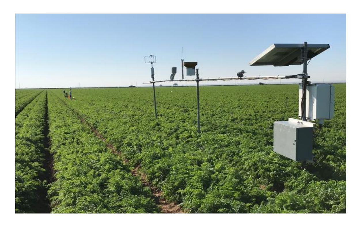
Monitoring stations in one of the commercial experimental sites.

Then, by tailoring those basic guidelines to their own site-specific situation and optimizing their practices, growers can maximize the amount of nitrogen taken up by the carrots – and minimize the amount that is leached out.