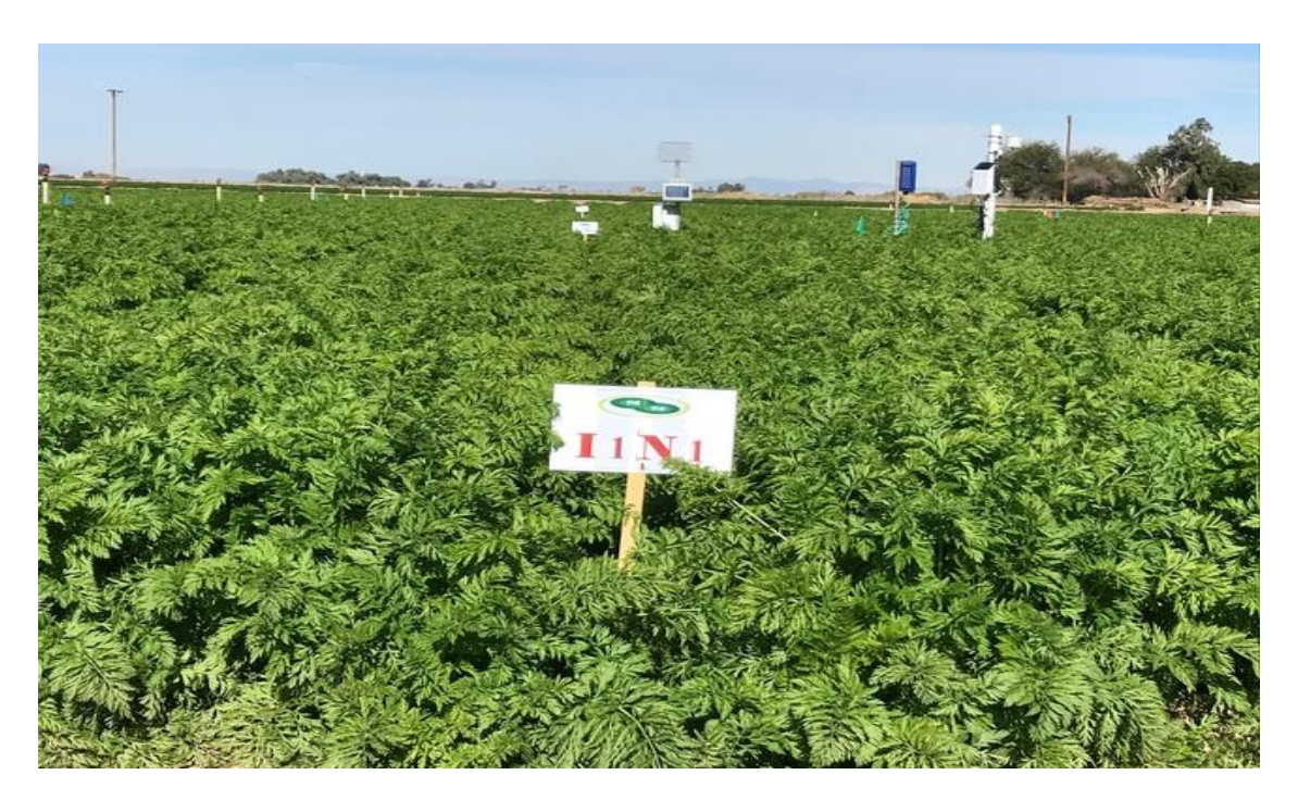
The trials at UC ANR's Desert Research and Extension Center consisted of two irrigation regimes and three nitrogen scenarios.

Two years of data from two experimental trials at UC Agriculture and Natural Resource's <u>Desert Research and Extension Center</u> – as well as from 10 commercial fields – produced <u>key recommendations</u> for farmers to make the most of their irrigation and nitrogen applications.