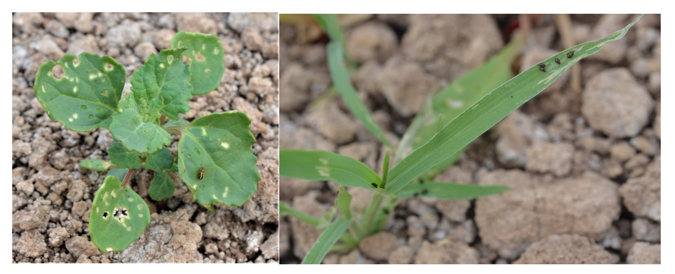
Figure 2: Palestriped flea beetle feeding on nettleleaf goosefoot seedling (left), potato flea beetle, Epitrix cucumeris feeding on grass host (right); presence of these weeds can increase the chances of flea beetle infestation in sugar beet fields, Holtville, CA.

{\small \textit{Ag Briefs}-\textit{October 2021}} \\