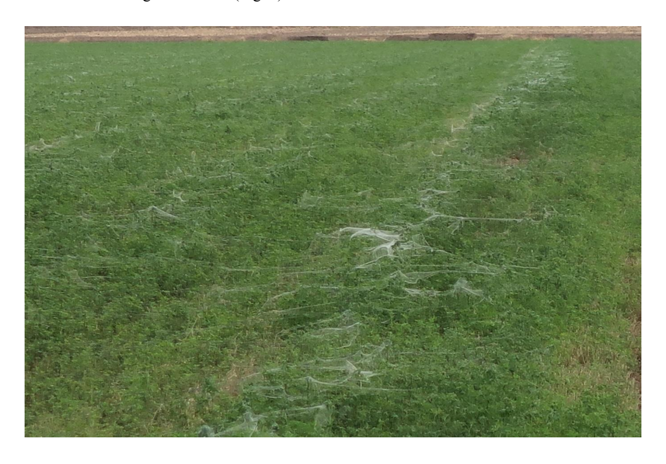
Fig. 1. An alfalfa field in the Palo Verde Valley, October 2020.

While some people decorate their residences to the extreme for the season, it appears that some alfalfa fields in the low desert also are being 'decorated' (Fig. 1).