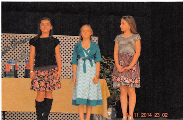
Junior Traditional Category