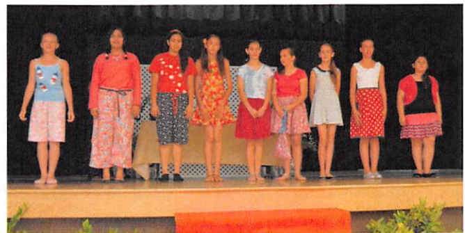
Intermediate Traditional Category